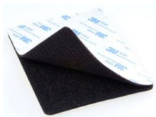
3M Velcro (default)